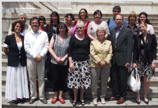
CompHP project partners during the meeting that took place in Cagliari, Italy in May 2010

We have also held two successful project meetings. The inaugural project meeting was held in September 2009 in the EAHC Headquarters in Luxembourg and was attended by all project partners. In May 2010, the first meeting of the Workpackage Leaders took place in Cagliari, Italy.